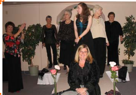
November 13, 2006 "Something for the Holidays" Fashion Show

April 19, 2007 The Annual Volunteer Appreciation Dinner ~ our chance to serve up a big thanks to our hard-working volunteers!