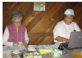
Team Spirit Award winners—the Real Deals Team from Second Story Treasures Thrift Store .

Anything's possible, with a little help from our friends at Vancity!