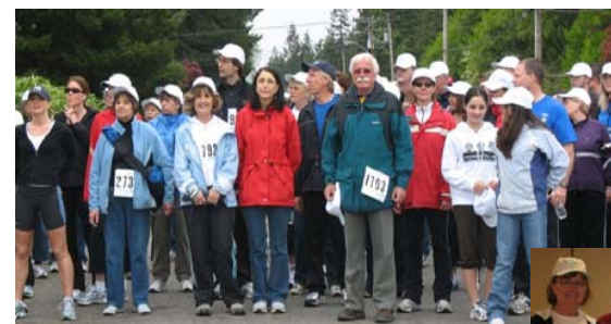
May 6, 2007 Walkers/runners getting ready to embark on the 7th Annual Journey Walk/Run for Remembrance .

Anything's possible, with a little help from our friends at Vancity!